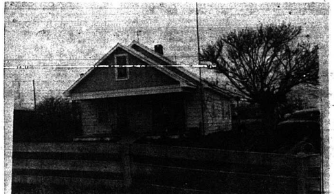
LOCATED - Ten (10) Miles South of Crab Orchard, Twenty (20) Miles North of Somerset, Approximately One (1) Mile Southwest of Kentucky 39 on the Flatwood Road (Old Styleville Road.) Watch for Auction Signs leading to the Sale!

The farm will be offered in two (2) separate tracts, reserving the right to combine them, selling whichever way reflects best returns for owners.