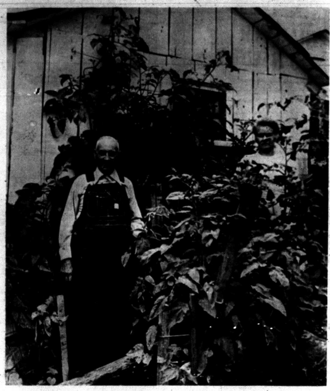
measures 8-10 feet in height and 6-7 feet in width. The tomatoes are of the large purple variety.