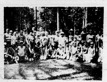
mp at J.M. Feltner 4-H Camp.