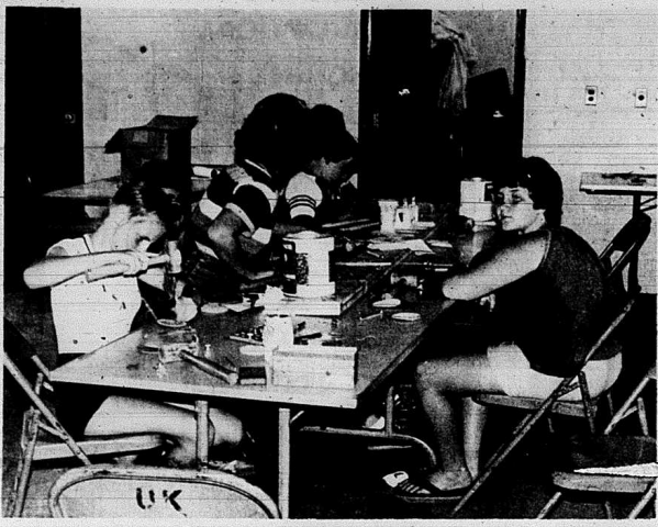
Rockcastle County 4-H'ers develop skills by participating in Arts and Crafts Projects.