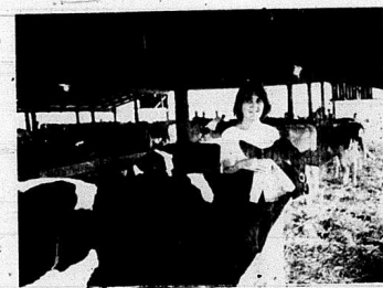
ring 4-H dairy cattle at District Dairy Show.