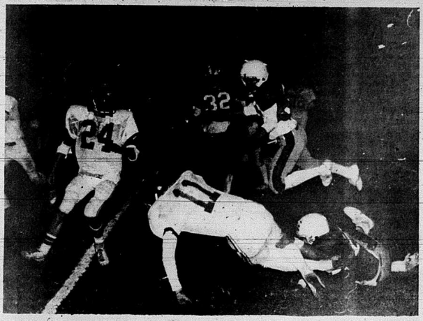
16 yards on the night. He also saw limited action Wednesday night against Lynn Camp.

Rockcastle 103. 7-6 in overtime but Casey Co. Friday 24-19.