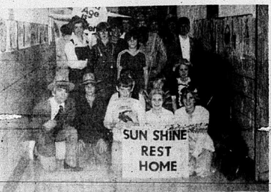
r Community Chub at Area Variety Show after place in county variety show.