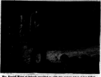
rided us with this picture taken of her fatt French, who died July 21, 1950, is shown v