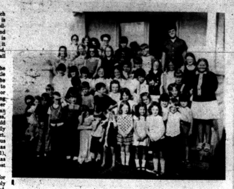
The Hickory Grove Free Pentecostal Church held its annual Vacai July 5-9th with a total enrollment of 58 and an average atten