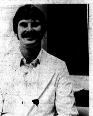
located in the rear part of Rockcas ers of the family doing general der Thursday, Friday and till moon on S