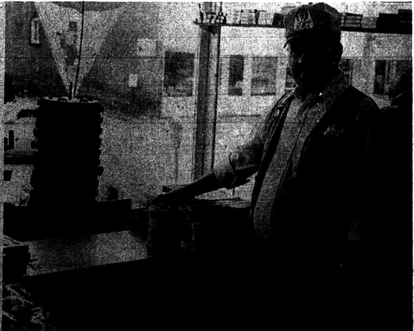
ident of REACT /4163 and district the state council, is shown placing in an attempt to raise funds to purchase a Jaws of donations in Hiatt's 5 and 10 on Mi. Vernon. The canisfers are be in next week's Signal].

The annual bronned School Alumni Banquet will be held this Saturday night, April 5 at 7 pm. All graduates and husbands'wives are invited to attend. Special recognitions will be given the classes of 1920, 30, 40, 50, 60, 70. For reservations, write Brodhead School, Brodhead, Ky, 40409 or call 758-8512. Reservations are $5.