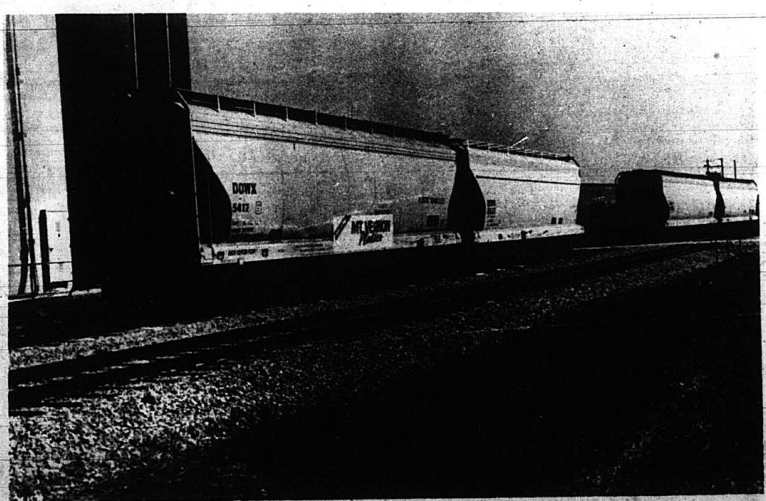
RAIL SPUR-The new rail spur for Mt. Vernon Plastics was dedicated during ceremonies at the plant Saturday.

In other action, the court voted to borrow $50,000 to pay bills left over from the 1984-85