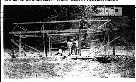
NEW SHELTER HOUSE-Mt. Vernon city employees work on a new shelter house at Lake Linbeach area at the lake.